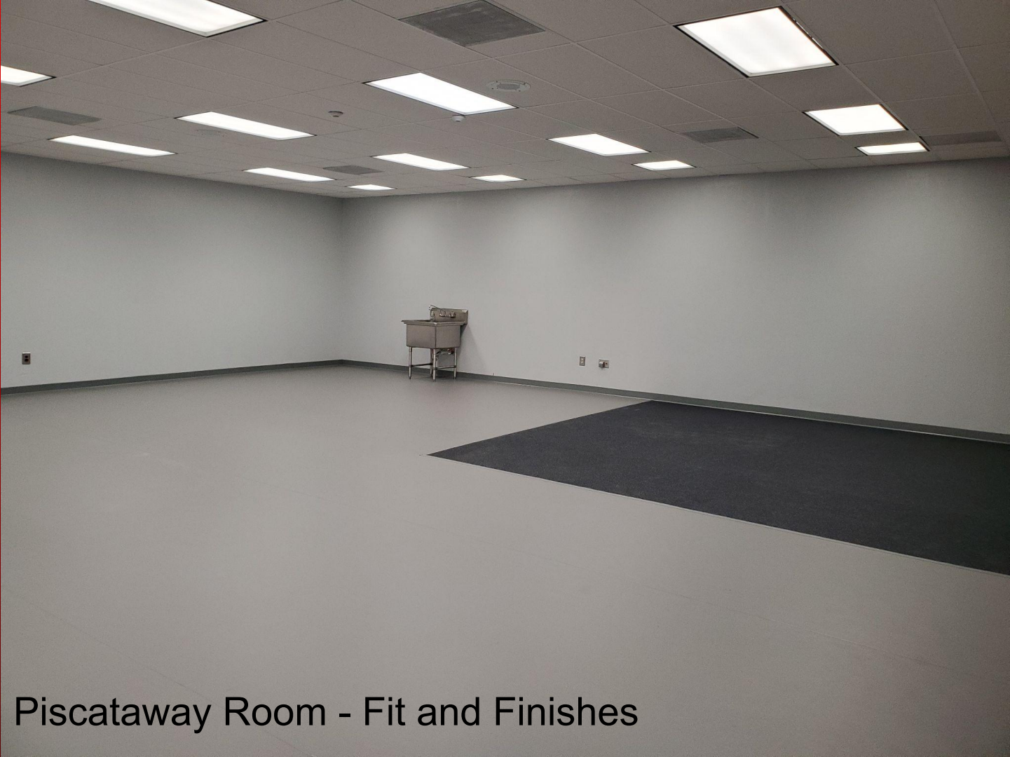
Piscataway Room - Fit and Finishes