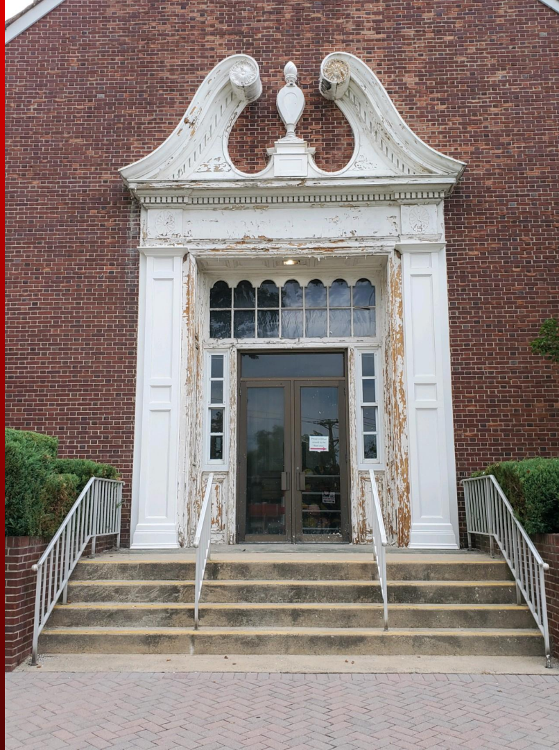
Woodbridge Academy Millwork Restoration Gym Entrance